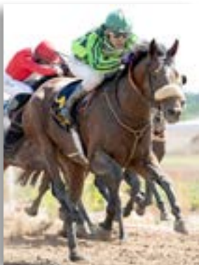
Realize Rock, 2 segrar, 895.700 kr