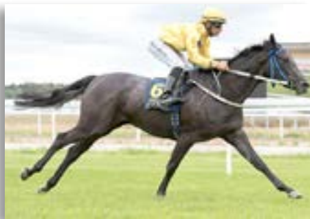
Jamaica, 4 segrar, 1.146.900 kr