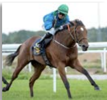
Ramone, 4 segrar, 1.228.731 kr