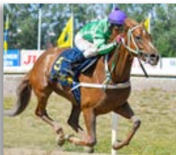
Powerpoint, 3 segrar, 751.900 kr