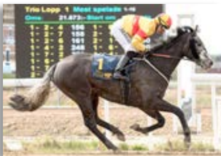
Man In The Moon, 3 segrar, 437.240 kr

Antal segrar och insprunget t.o.m. 2019-08-04